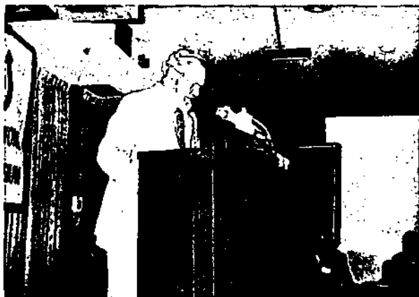
Dr. J. Allen Hynek, Director of CUFOS, addressing the symposium