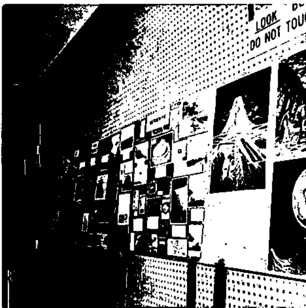
Visual UFO Display